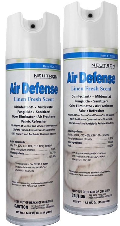
Linen Fresh Scent Case of 12 cans #126233

Air and Fabric Freshener: Lightly spray the air or onto porous surfaces such as A/C filter, upholstery, drapes, mattresses, bedding and carpets to remove odors. Will not harm most washable surfaces.